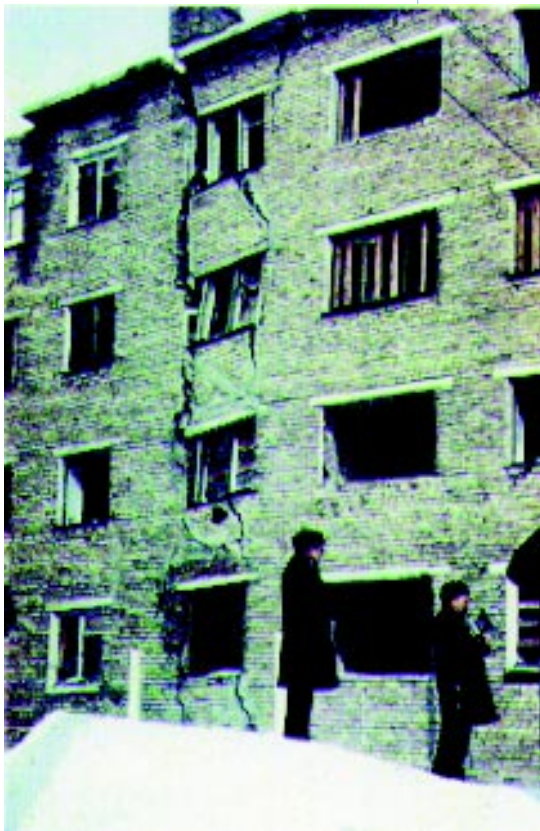
Fig. 15. Typical examples of the effects of permafrost thawing on buildings and pipelines in Siberia.

effects due to climate change, the better one can adjust to changes. This is true whether the impacts are in fisheries, forestry or other economic activities. Even though long-term forecasts may be highly uncertain, they may still be valuable.